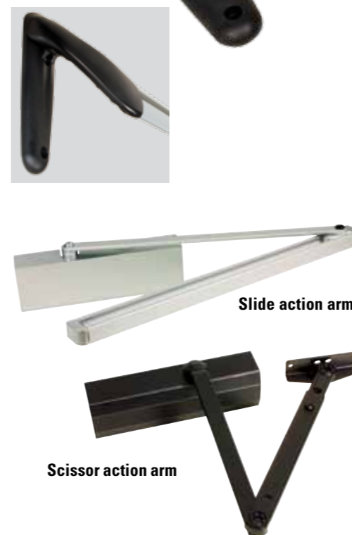
Slide action arm

It has a lever mechanism of rotation of ball bearing with variable effort. Minimum drive (patented). Available in different lengths, it is easily shortened, in any position without holes / slots for interlocking the fingers, resistant to corrosion. Available in different finishes to match any setting and with the possibility of installation through the cylinder, handle and cylinder outside, etc..