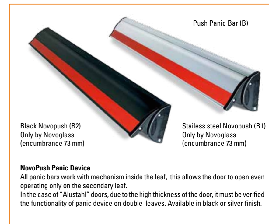
Black Novopush (B2) Only by Novoglass (encumbrance 73 mm)