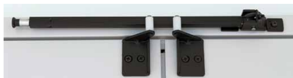
Leaf Closing Selector