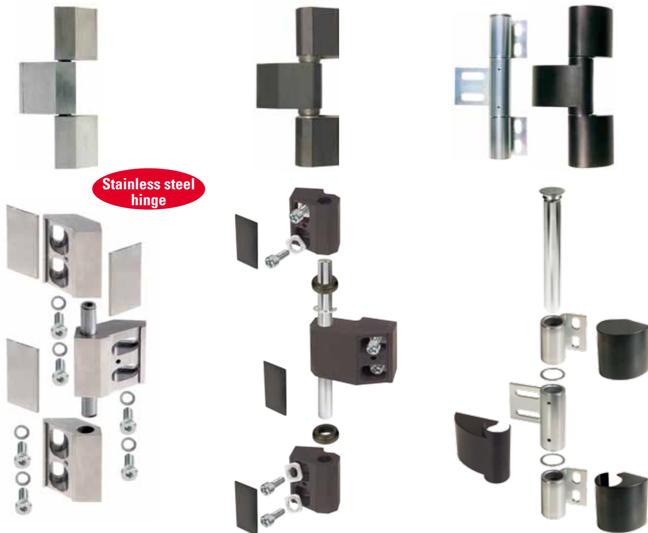
Stainless steel hinge

Stainless steel hinge with hidden adjustment device. Used where the presence of water can be a problem for the traditional hinges. The adjustment of the door is carried out through stainless steel screws, placed under the innovative sliding system. This allows to hide the screws but maintaining the simplicity in adjustment. Optional in Elite and Novoglass doors.